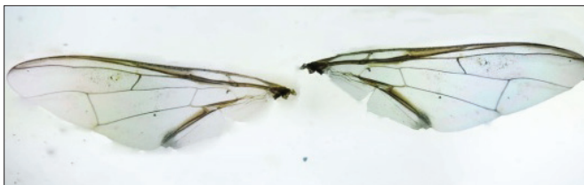
Bactrocera dorsalis with distinct colored band from end of vein Sc to end of vein R_{4+5}