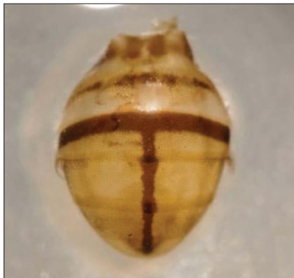
Bactrocera dorsalis with prominent black 'T'-shaped mark