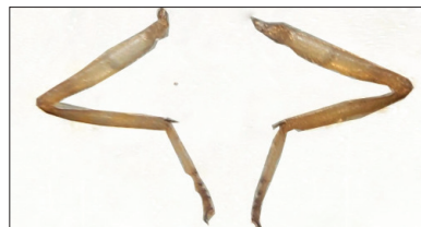
Bactrocera correcta hind tibia with keel like process