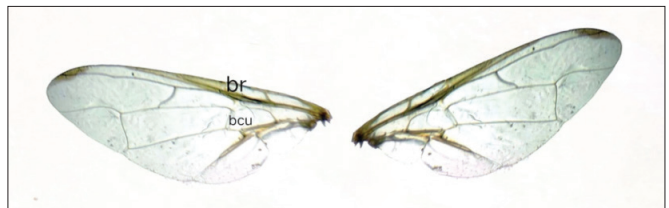
Bactrocera zonata , lacking microtrichia and absence of an anal streak.