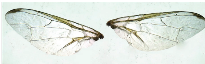
Bactrocera correcta with extremely narrow costal band, where it expands into a spot with microtrichia