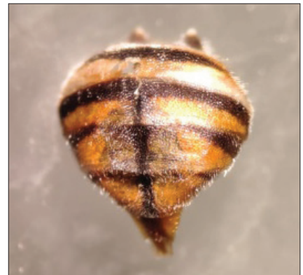
Bactrocera zonata with no medial dark line except for tergite 5