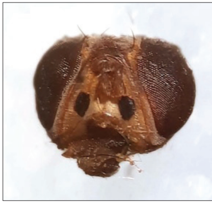
Bactrocera dorsalis with big dark round facial spots