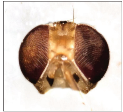
Bactrocera zonata with oval brownish-black facial spots