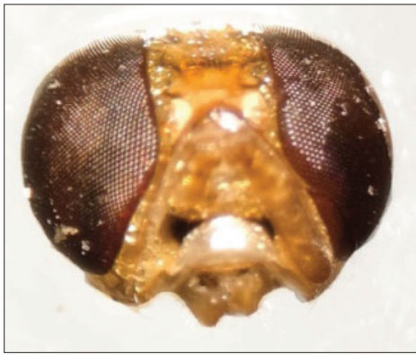
Bactrocera correcta elongated black spots arranged transversely